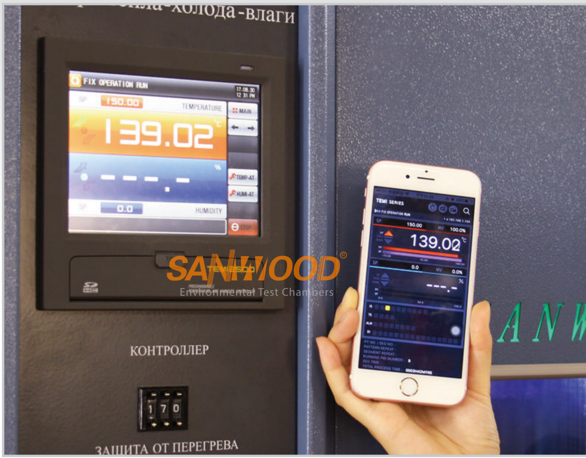
Remote network system