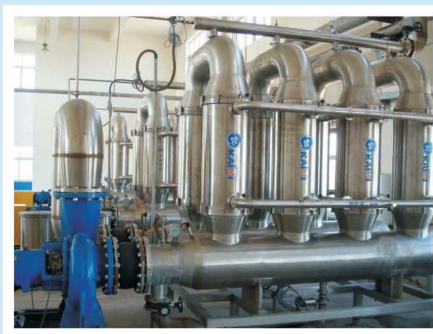
Ceramic membrane plant on site