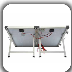
— product details —