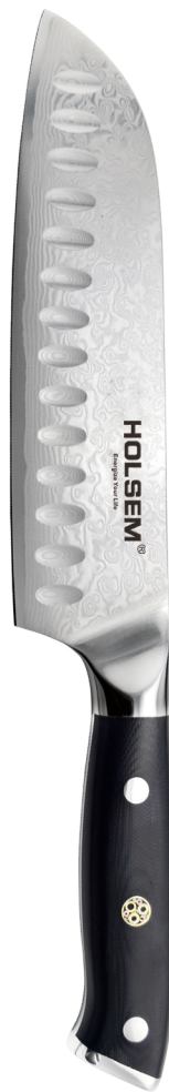
HOLSEM 7 inch Japanese Santoku Knife